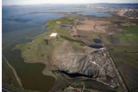
Aerial photos of Dumbarton Quarry before it was filled