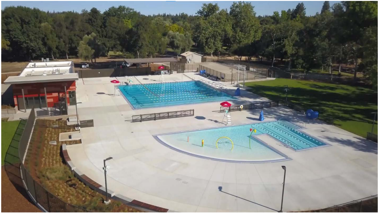
Figure 2 - After: The Cordova Community Pool Replacement Project scope included the addition of a 10-lane competition pool, an activity pool with water play features, a large grass area and a new 3,000 sq.ft. building for office space, lockers, restrooms and pool equipment.