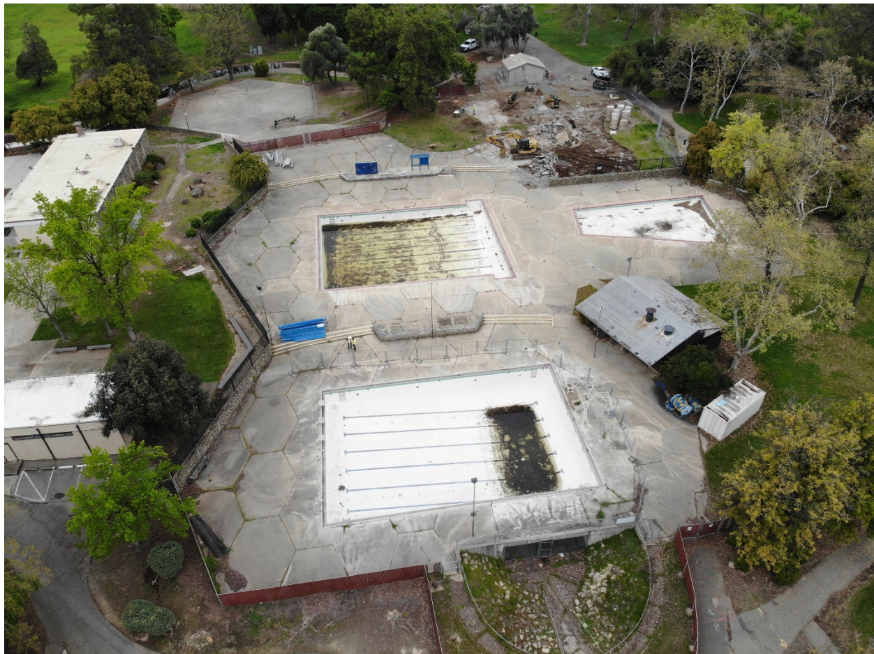
Figure 1 - Before: The Cordova Community Pool Replacement Project scope included the demolition and removal of the existing facility shown above.

District: Cordova Recreation & Park District